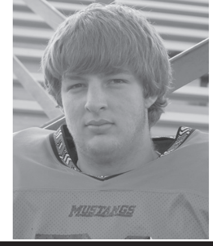
First Nebraska Bank