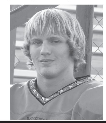
Kuehn Auto Body & Kuehn Auto Sales