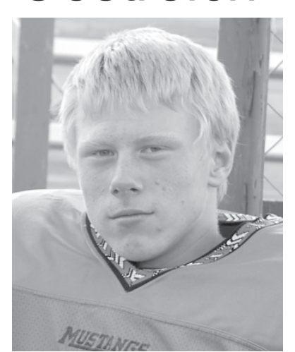
First National ___Agency